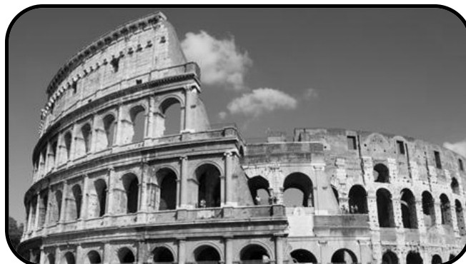
BARCELONA TO VENICE MEDITERRANEAN CRUISE OCTOBER 1-15