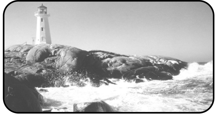
PEI & NOVA SCOTIA TATTOO JUNE 25 - JULY 2