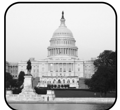
WASHINGTON & WILLIAMSBURG OCTOBER 25-29