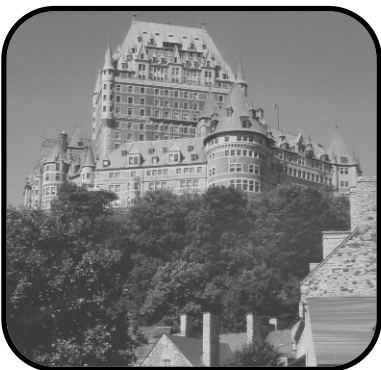
GANANOQUE & QUEBEC CITY SEPTEMBER 19-23