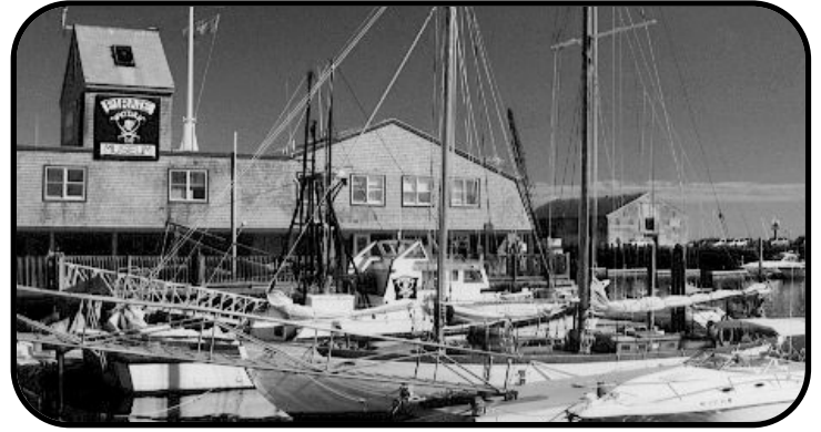
BOSTON & CAPE COD SEPTEMBER 9-13