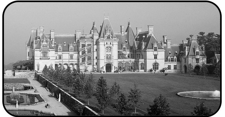
NORTH & SOUTH CAROLINA OCTOBER 18-27