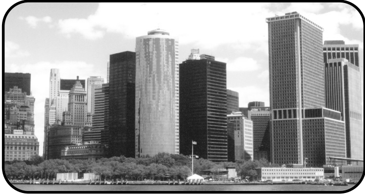
NEW YORK CITY MAY 19-22 AND DECEMBER 1-4