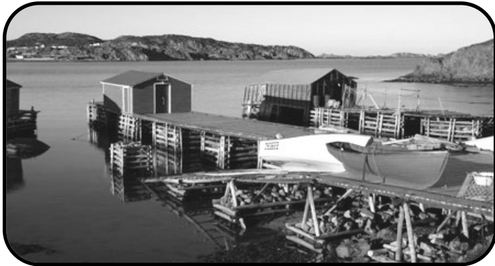
NEWFOUNDLAND JULY 5-13