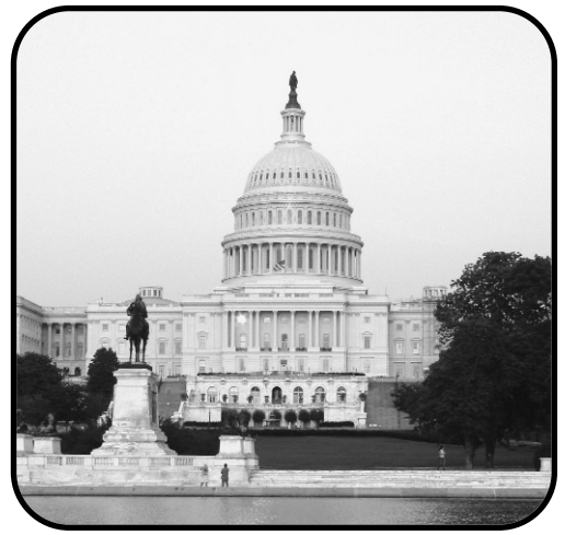
Photo Credits: New York, Myrtle Beach, Whale: Earl Clint Muskoka: Tom Desloges Newfoundland, Chicago, Amish Buggy: Google Images Biltmore Estate: Used with permission from the Biltmore Company, Asheville, N.C. Capitol Building: Washington D.C. Tourism Corporation