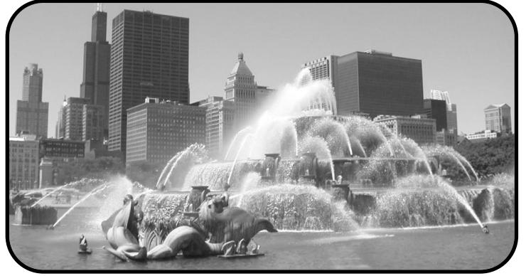
CHICAGO AUGUST 24-27