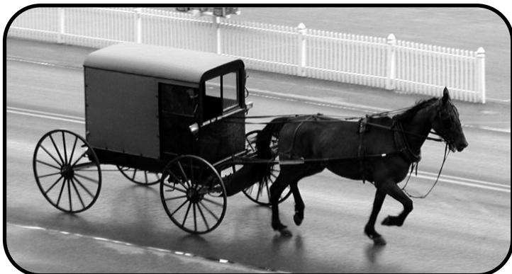
LANCASTER, PENNSYLVANIA SEPTEMBER 25-27