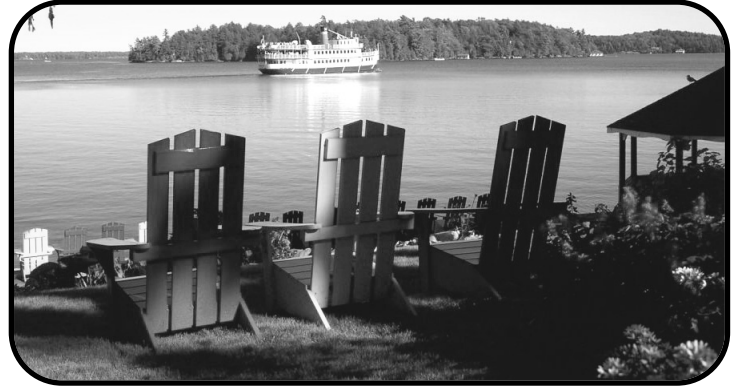
ORILLIA & MIDLAND JUNE 27-28